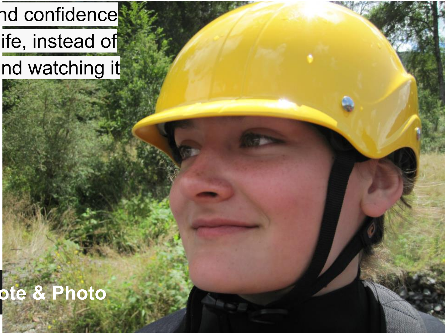
Student quote & Photo

The experiences I had at the Alzar School gave me the skills and confidence to take on life, instead of sitting around watching it go by.